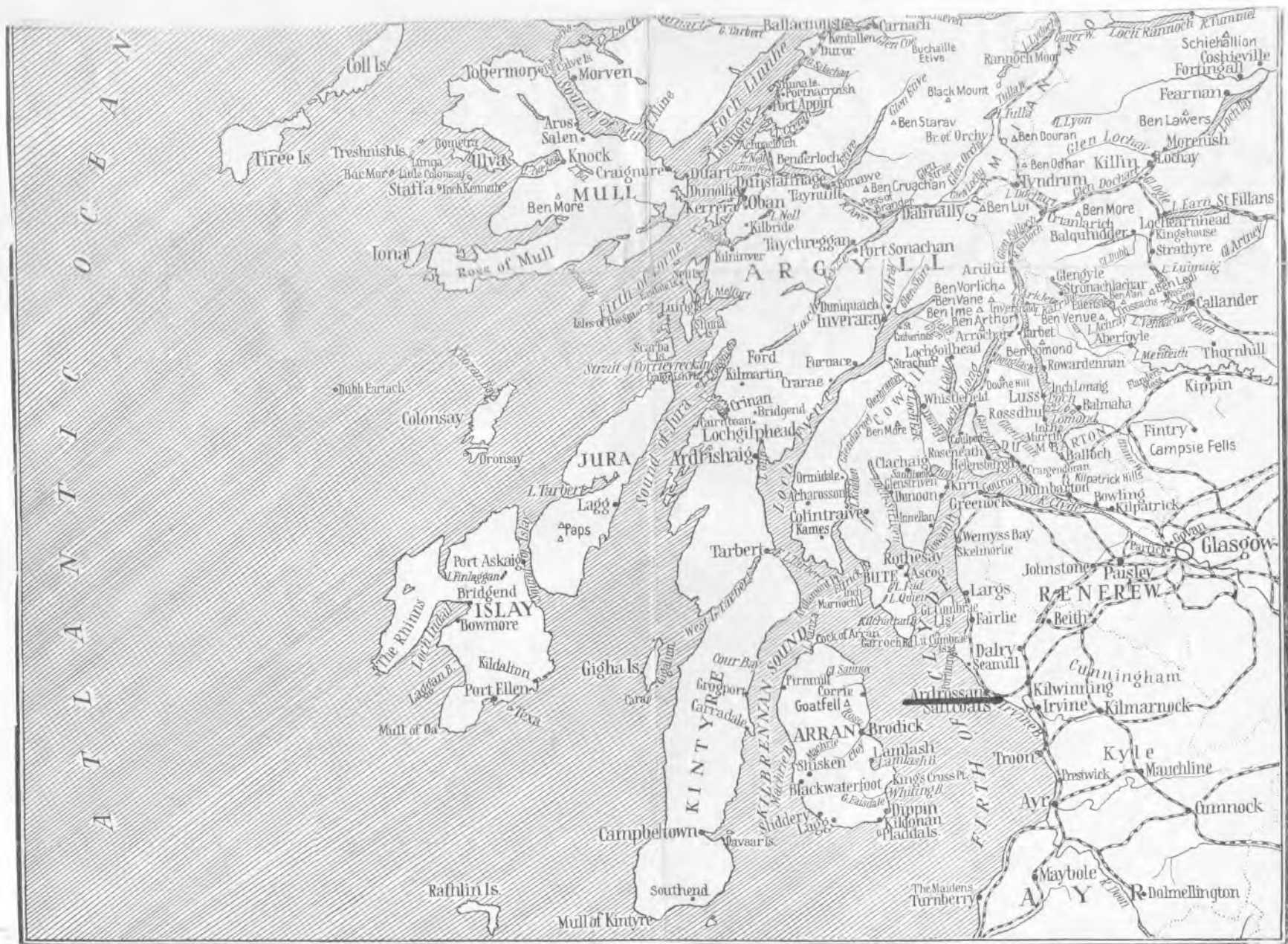
PORT OF ANDROSSAN WHERE THE SCHOONER "EZEL" LOADED COAL FOR CADIZ. 1875