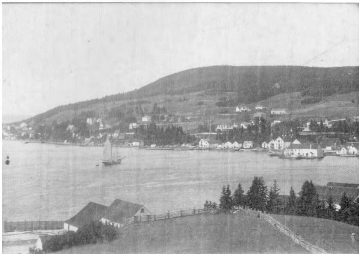
IN THE DAYS OF SAIL - SCHOONERS IN THE SHELTERED HARBOUR OF GASPÉ BASIN.